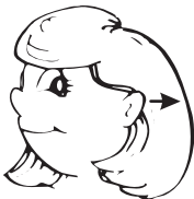
PULL YOUR EARS BACK.