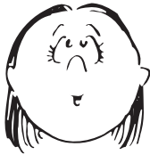
PULL YOUR SCALP BACK.

Did you know that it takes 34 muscles to frown ( really frown) and only 13 to smile? Exercise your facial muscles with these expressions.